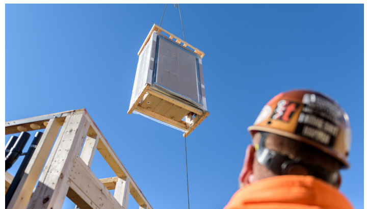
A Katerra Bath Kit is delivered to a jobsite.