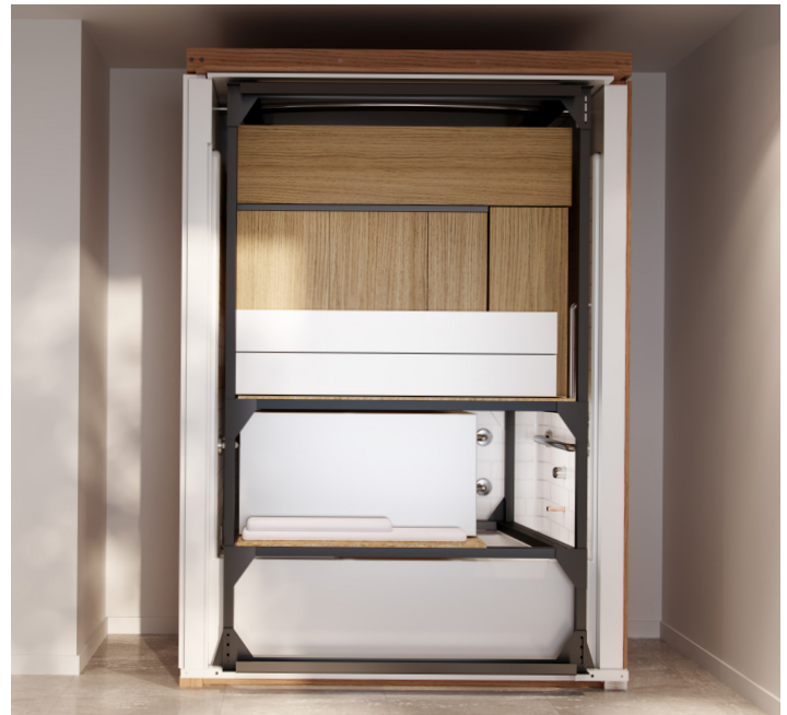
Katerra Bath Kits are packaged for maximum efficiency.

Tailored for a range of product customization options.